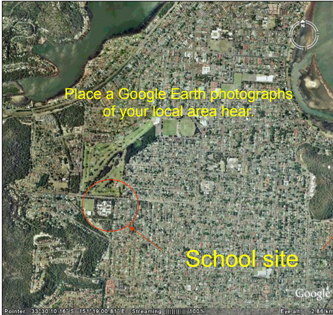
Recent Air Photograph from Google Earth

Loss of biodiversity often results from urban development. What changes have taken place in your local area?